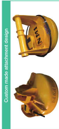
Custom made attachment design