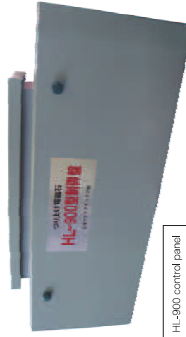
HL-300 control panel