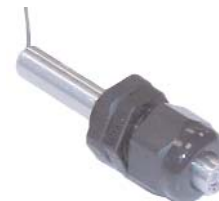
150063 APJ-1 Thru-Fitting plastic fitting with lock nut, sealing nut and hub 1.17" x 0.59" (29.7 x 14.99 mm) PG-7 thread