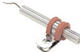
150038 MB-4 APJ-1 clamp mounting bracket Stainless Steel, with silicone cushions 0.38" diameter