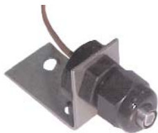
150062 & 836068 micro Thru-Fitting & MB-2 Mounting Bracket plastic fitting with lock nut, sealing nut, and hub 1.17" x 0.59" (29.7 x 14.99 mm) PG-7 thread