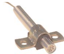
150065 APJ-1 Omega clamp metal clamp with rubber cushion for mounting 1.81" x 0.78" (45.97 x 19.81 mm)