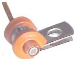
150037 MB-5 micro clamp mounting bracket Stainless Steel, with silicone cushions 0.25" diameter