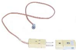
108000 IRt/c connector kit type K thermocouple connectors