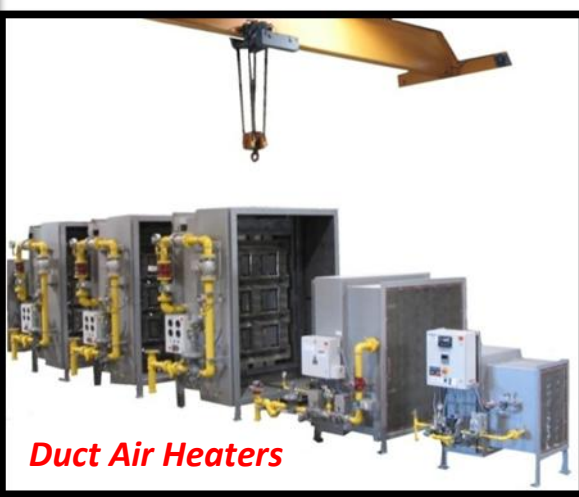
Duct Air Heaters