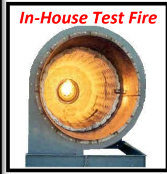
In-House Test Fire