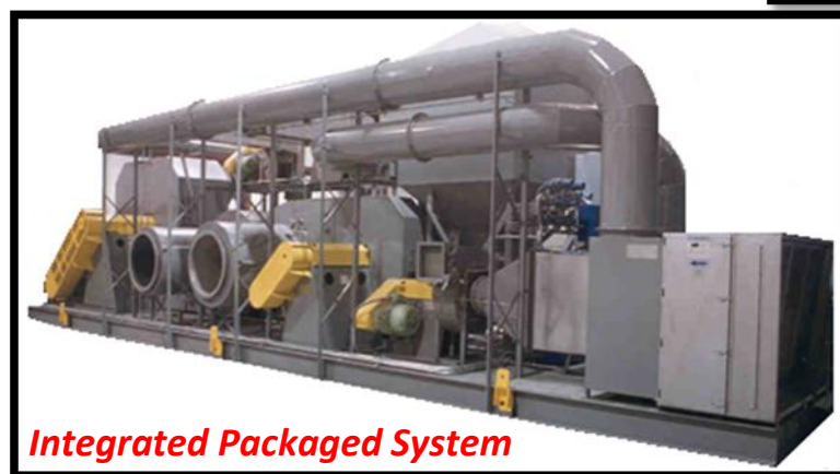
Integrated Packaged System