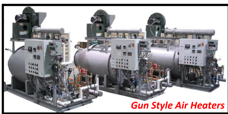
Gun Style Air Heaters