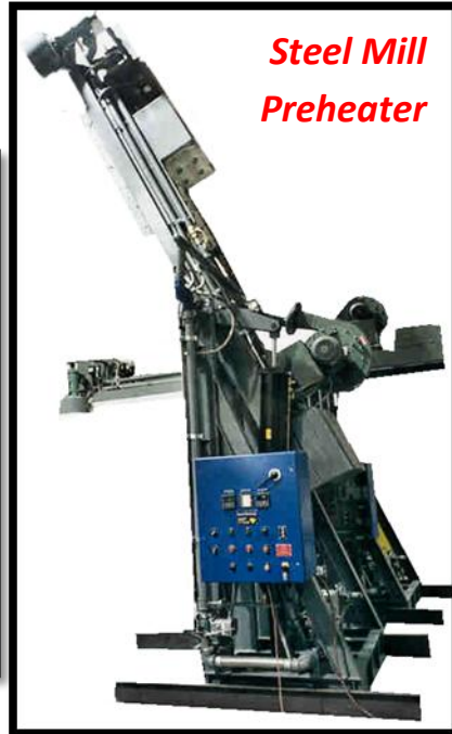
Steel Mill Preheater